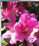
All of our closest friends!